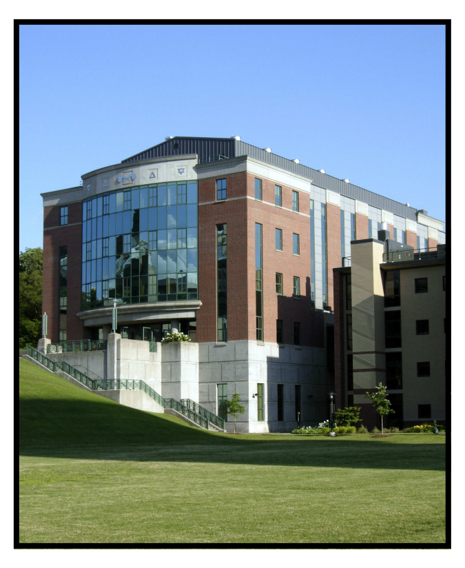
For Calendar Year 2008