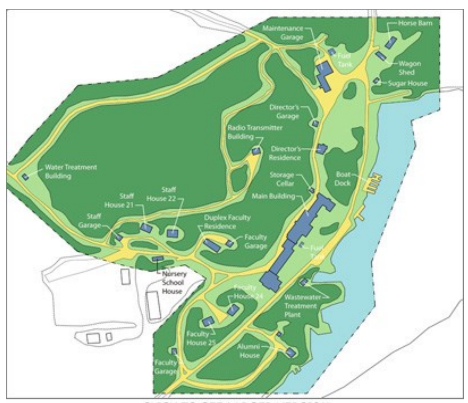
CLICK TO SEE LARGER VERSION